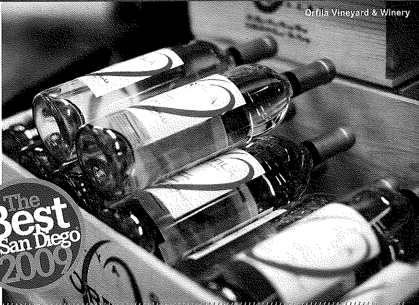
Orfila Vineyard & Winery

SUMMERTIME COCKTAIL Starlite's copper mugs can barely contain all the wonderful goodness and synergy of organic vodka, ginger beer, bitters and a slice of lime. The famous Starlite Mules go down easy, pack a swift kick and ensure devotees return to this Mission Hills lounge night after night. 619-358-9766; starlitesandiego.com .